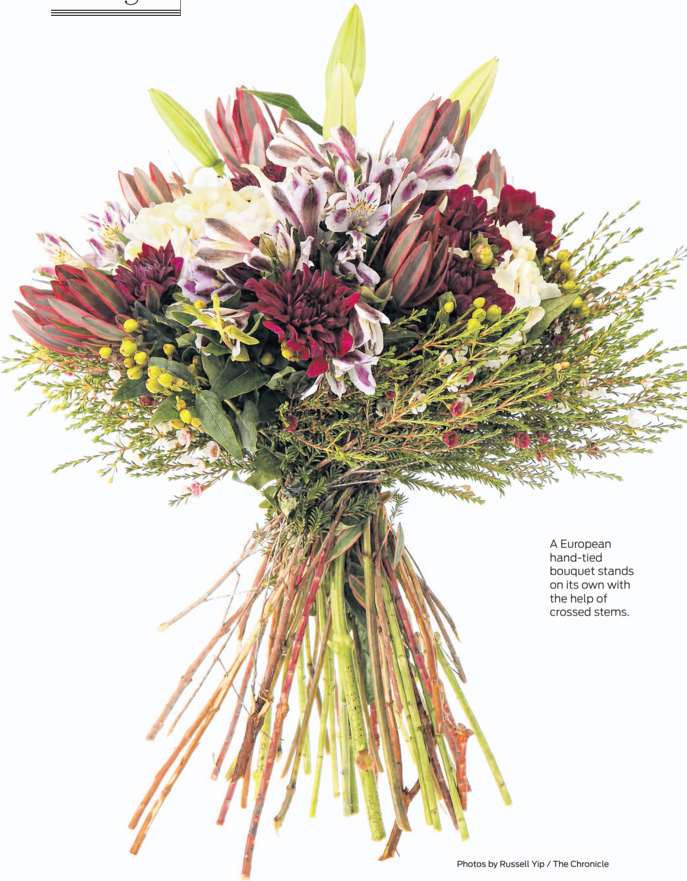
A European hand-tied bouquet stands on its own with the help of crossed stems.